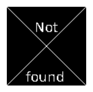
Note: Parenthesis indicate a credit balance

Assume a business combination took place at December 31, 2012. Atwood issued 50 shares of its common stock with a fair value of $35 per share for all of the outstanding common shares of Franz. Stock issuance costs of $15 (in thousands) and direct costs of $10 (in thousands) were paid to effect this acquisition transaction. To settle a difference of opinion regarding Franz's fair value, Atwood promises to pay an additional $5.2 (in thousands) to the former owners if Franz's earnings exceed a certain sum during the next year. Given the probability of the required contingency payment and utilizing a 4% discount rate, the expected present value of the contingency is $5 (in thousands).