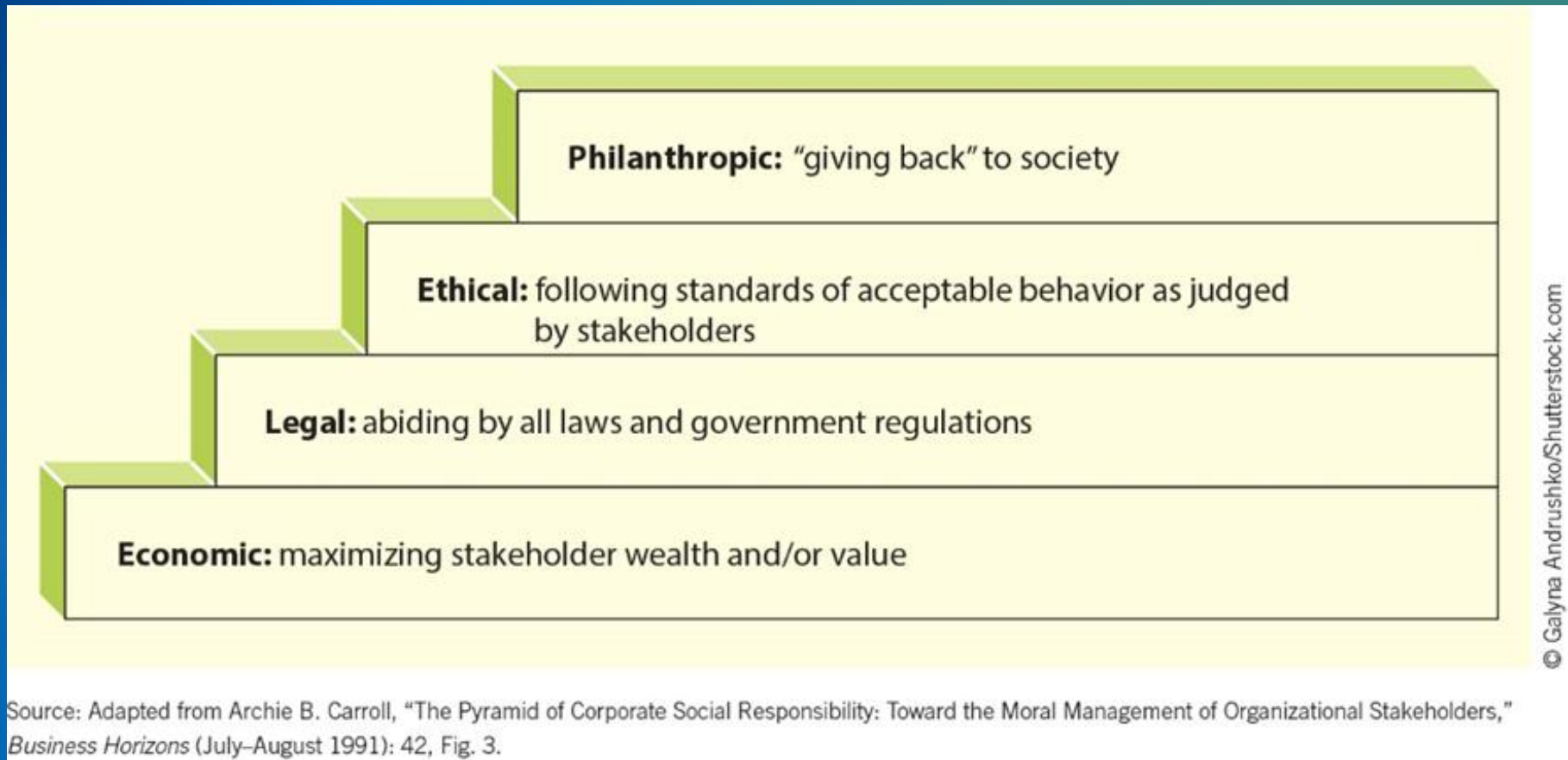
Figure 2.3 - Steps of Social Responsibility