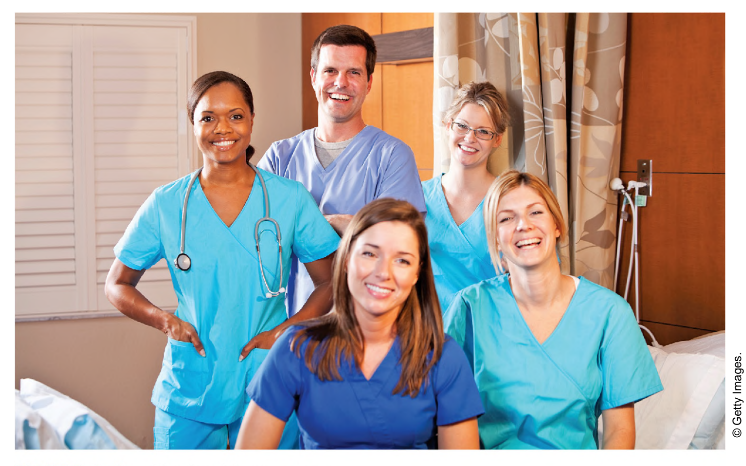
FIGURE 2-2 The health-care team.