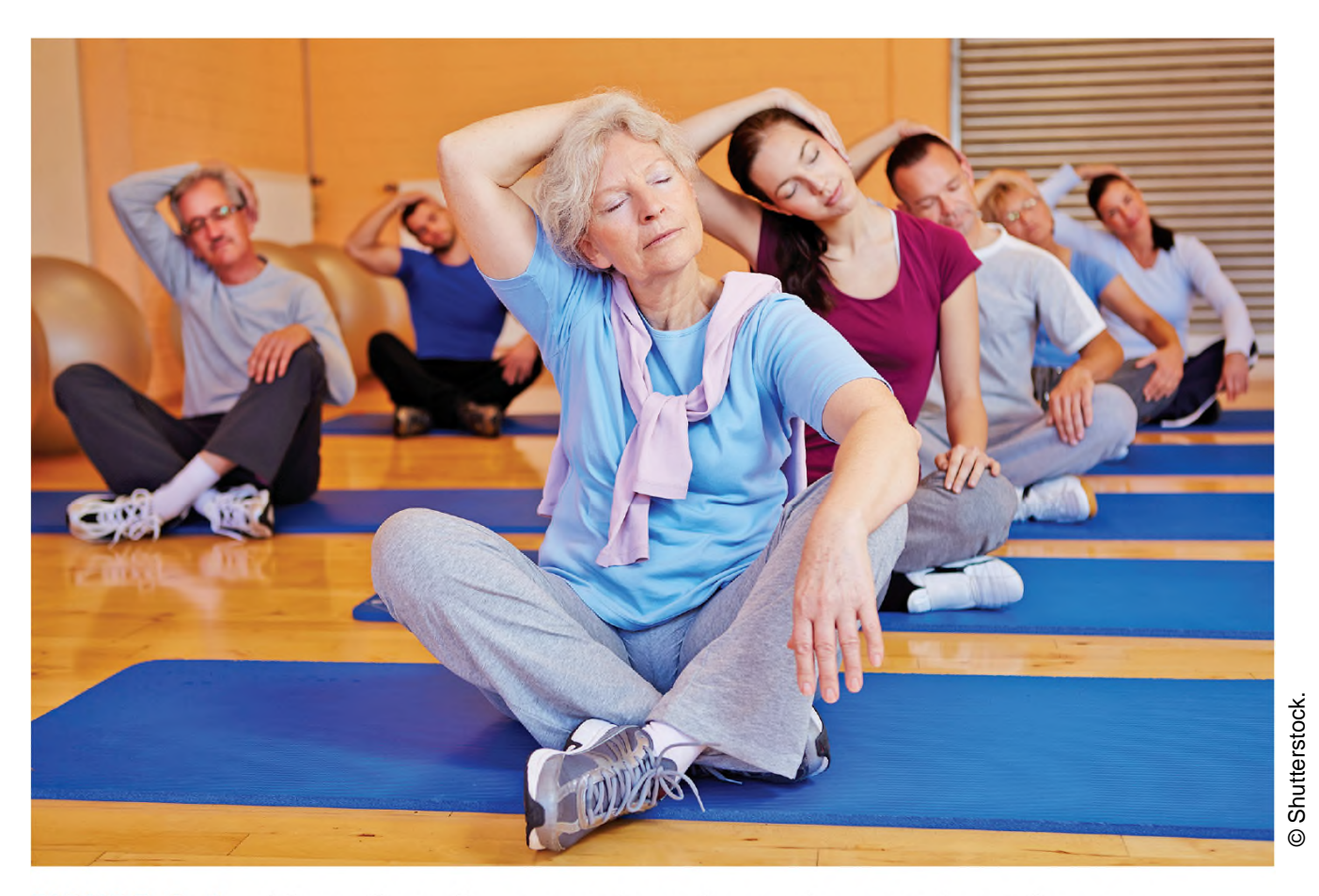
FIGURE 2-1 Many Canadians remain active and energetic as they age.