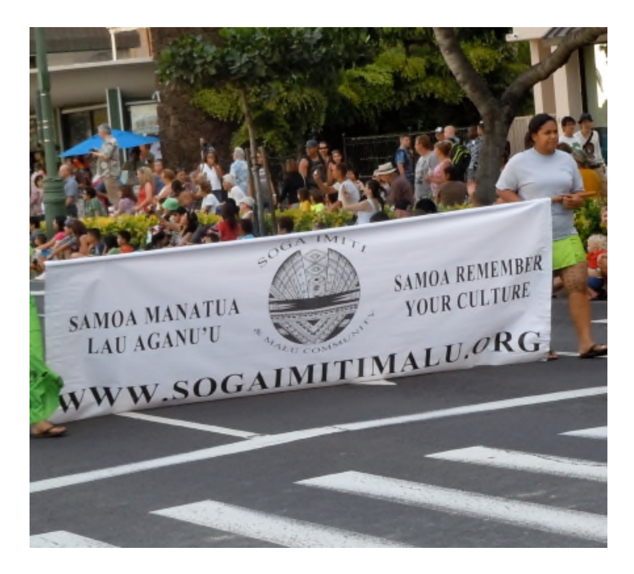
Figure 2.1 Remember "YOUR" Culture – Parade banner.