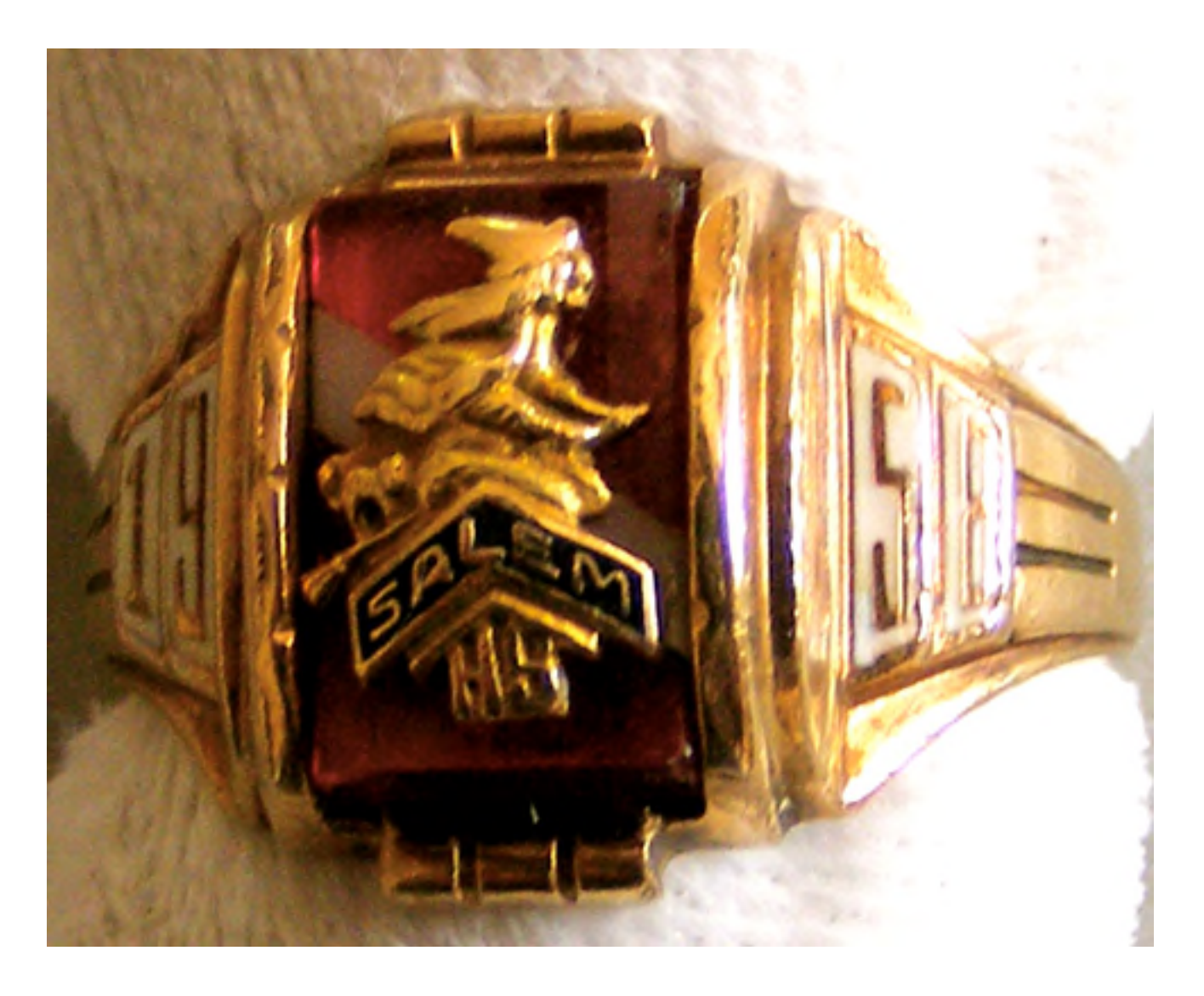
Figure 2.3 Class Ring – Meaningful icon.