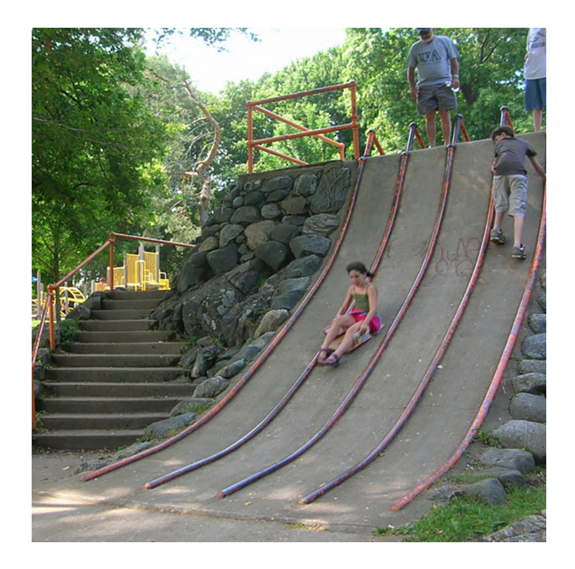
Figure 2.2 Slide – A cement playground slide that four generations of my family played on.