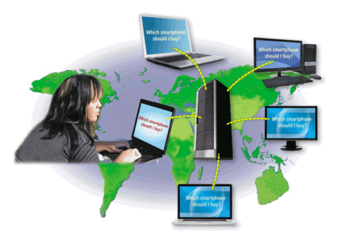
175. Explain what an IM is, and what the technology shown in the accompanying figure is. ANSWER: Student responses will vary, but should be drawn from the following information from the

LEARNING OBJECTIVES: VERR.DICO.15.8 - 8 TOPICS: Critical Thinking