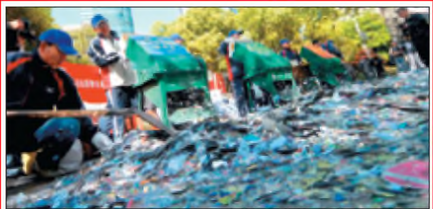
A security guard stands near a pile of pirated CDs and DVDs before they were destroyed at a ceremony in Beijing on Saturday, February 26, 2005. Thousands of pirated items were destroyed in the event, one of a number of activities, including an antipiracy pop concert later Saturday, that were staged by China's government to publicize its antipiracy efforts.

Agreement amongst member states of the World Trade Organization (WTO) to oversee the enforcement of stricter intellectual property regulations.