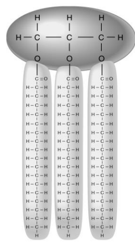
Triglycerides with saturated fatty acids have straight tails, allowing them to pack closely together.

Answer: TRUE Topic: Sec. 2.5 Skill: Knowledge/Comprehension