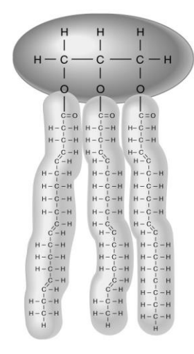
Triglycerides with unsaturated fatty acids have kinked tails, preventing them from packing closely together.

14) The figure above shows a triglyceride that is liquid at room temperature.Answer: TRUETopic: Sec. 2.7Skill: Knowledge/Comprehension