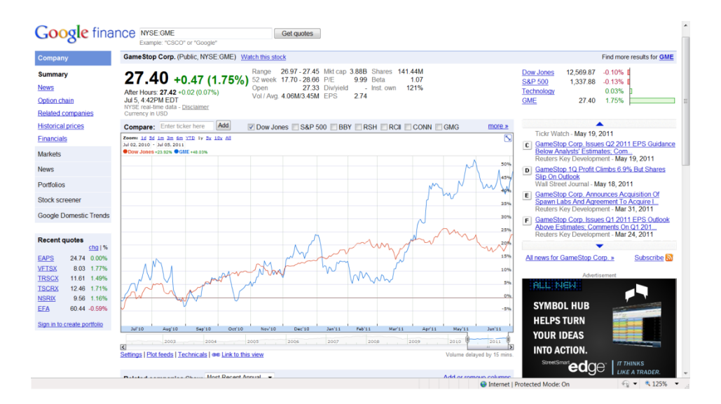
E-Project 2— Analyzing Movie Download Times with Excel

1. Download the file called CH02_MediaDownloads. This file shows the approximate file sizes for different kinds of media, along with estimated download times.