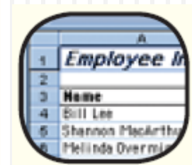
Excel: Productivity Measurement