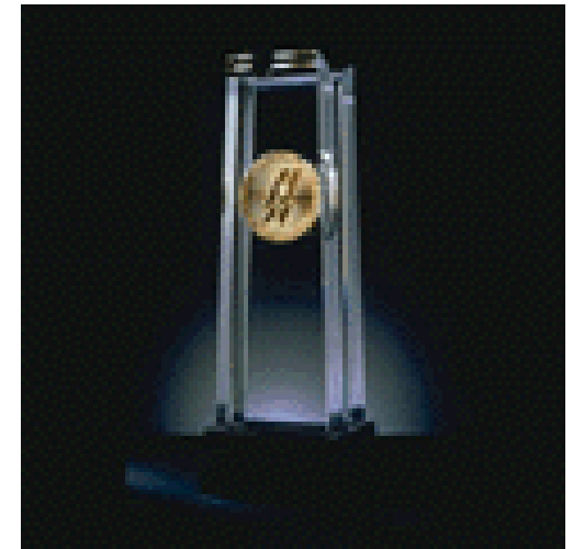
Baldrige Award trophy