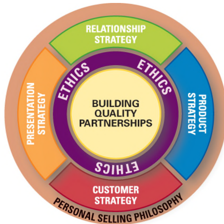
Figure 2.4 The major strategies that form the Strategic/Consultative Selling Model are by no means independent of one another. The focus of each strategy is to satisfy customer needs and build quality partnerships.